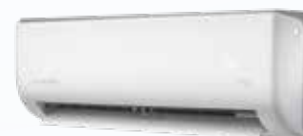
Serene wall hung split