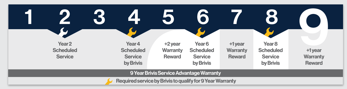
*5 year + 4 year extended. Conditions apply, visit Brivis.com.au for full terms and conditions.